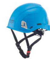
2 - Light blue