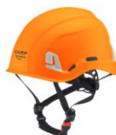
4 - Orange