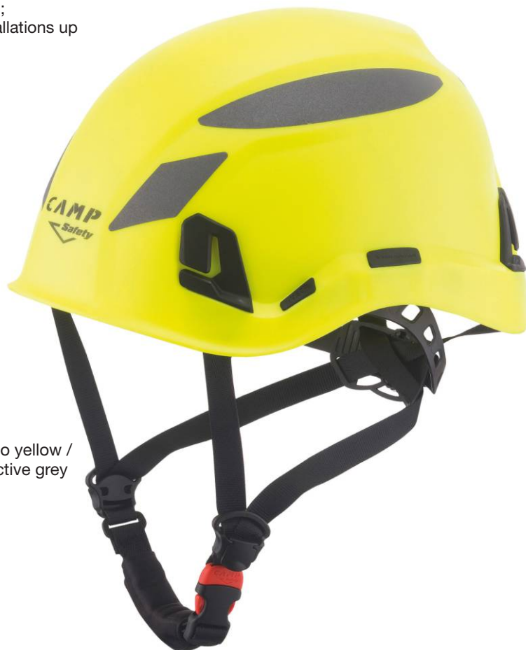
3 - Fluo yellow / Reflective grey