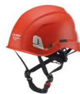
1 - Red