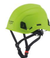
6 - Green