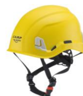
5 - Yellow