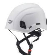
7 - White